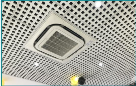
CASSETTE TYPE AIR CONDITIONERS