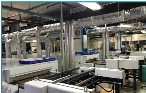
INDUSTRIAL HVAC SYSTEMS