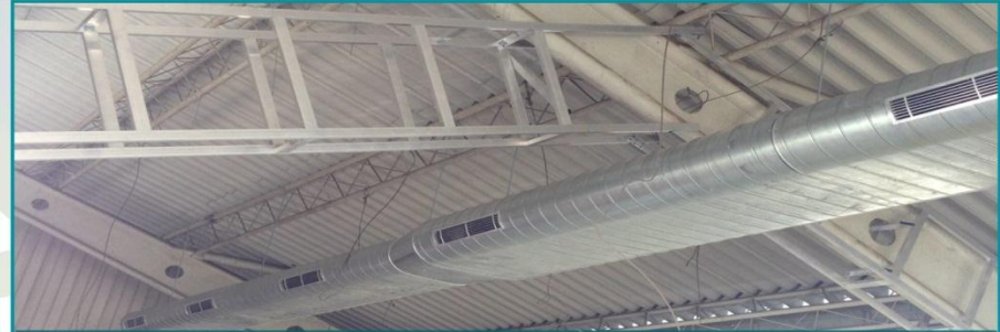
INDUSTRY OVEL SAHPE SPIRAL DUCT