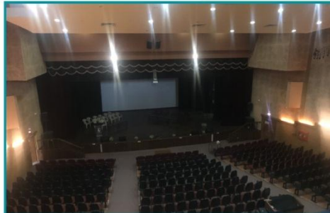
CENTRALIZED AIR CONDITIONING