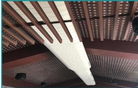
OPEN DUCTING SYSTEMS