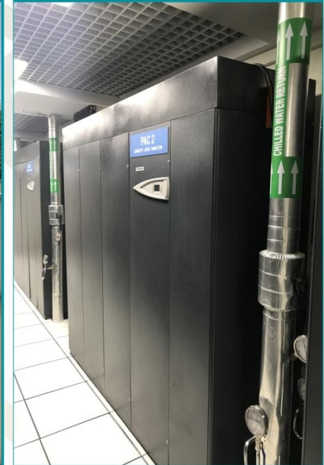
PRECISION AIR CONDITIONING UNITS